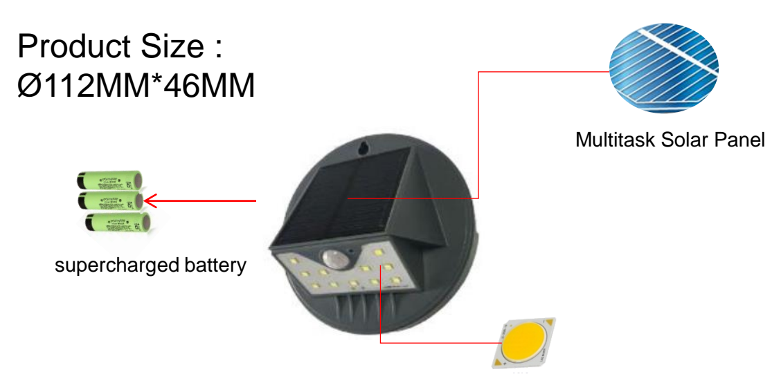
SensLights LED Chip

12. Application Area: Fence, wall, step, public area, villa gardens, corridors, roadway and so on for illumination and decoration.